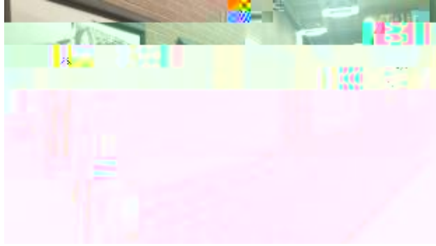
4 - Aisle in west side of library

At both campuses the reference collections were either removed or added into the books that can be checked out. This creates better accessibility for useful and relevant items as well as clearing out items that are no longer relevant resources for Oregon Tech students. Over all XXXX items have been withdrawn due to lack of use and relevance, making room for student spaces and modernization projects.