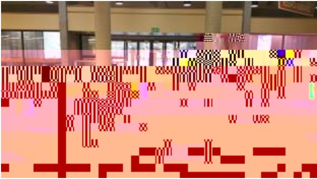
1 - new open front area of the library available for student use, collaborative space. Furniture coming by December 2018.

The Oregon Tech University Libraries are stretching beyond the traditional academic library. With information available in many more ways than items on a shelf, we are reaching for new ways to connect students, faculty, and staff to research, information, information literacy, and success.