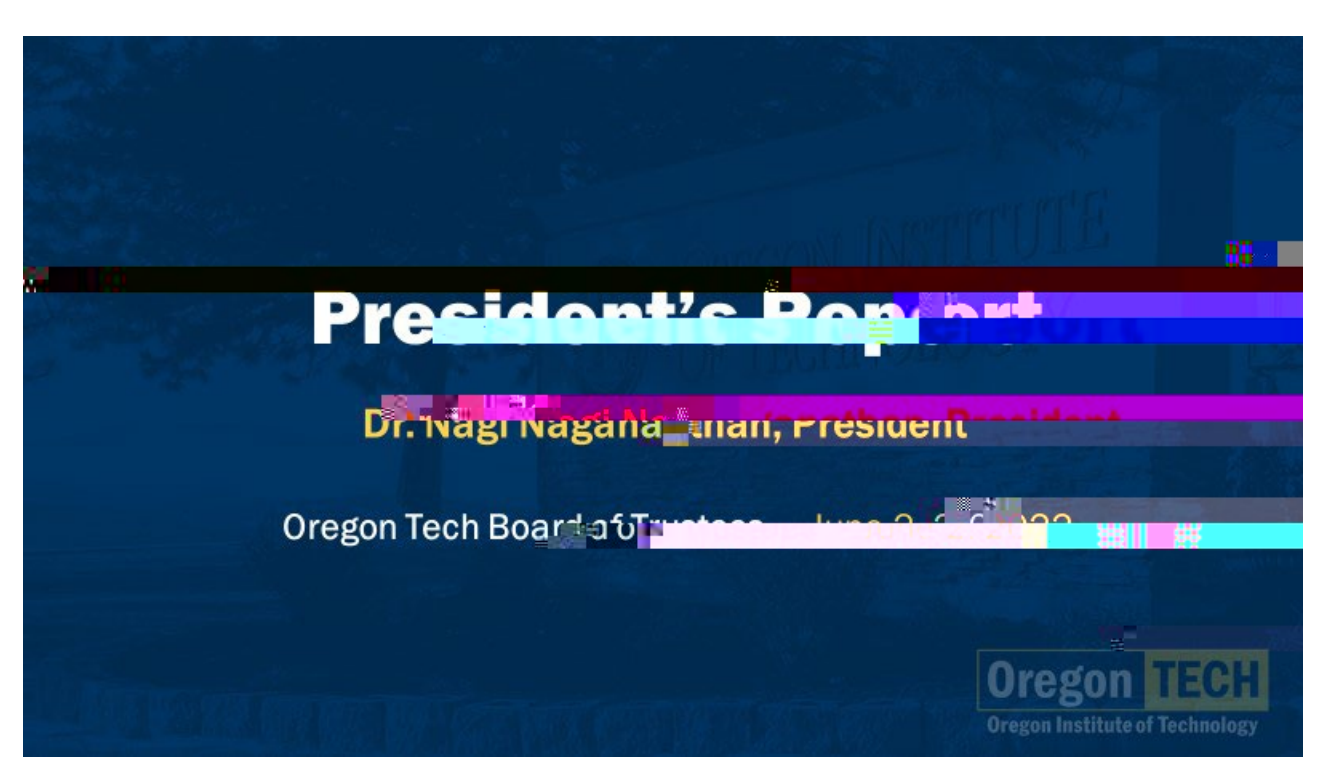
Control +Click or right click and select "Open Link" on image above to view PowerPoint