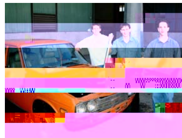
Students with OREC's Hybrid Kit Car