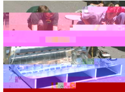
Students testing the bi-facial solar cell parabolic concentrator system